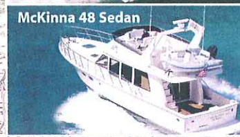
McKinna 48 Sedan