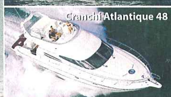
Cranchi Atlantique 48