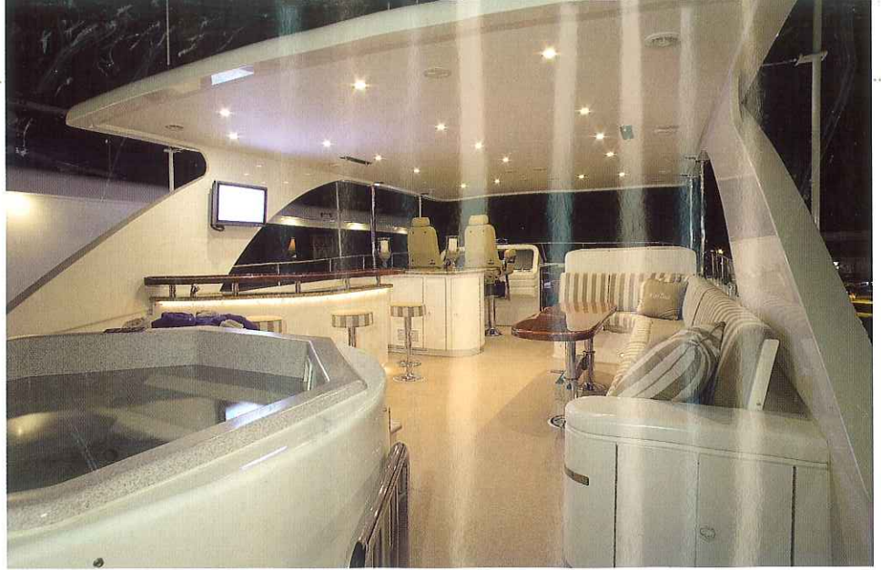
Fully-equipped for day or evening relaxation, the carpeted flybridge features a custom hardtop with helm station forward and watertoys aft.

While Katina was designed to have everything on board required to make her an excellent charter yacht, at heart she's a family boat. Child gates and door locks are found throughout and comfort is paramount, as is onboard entertainment. This is a yacht for the whole family, whether they be eight months or eighty years old. □