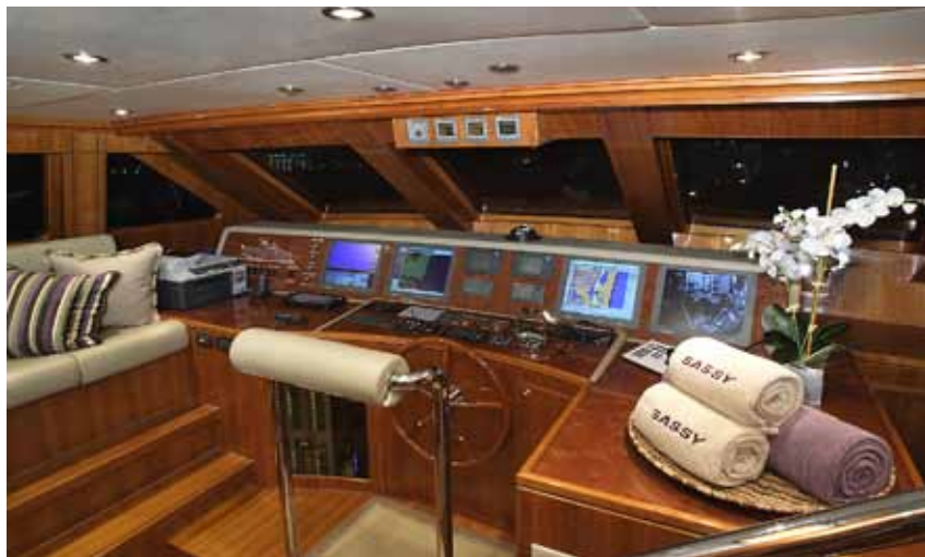
The well-equipped wheelhouse, above, offers owners a quiet place to read or set up a temporary office.

rushing up and down stairs and sidestepping guests, the crew can now quickly service the cabins and access the laundry. Tucked away in the foyer is a walk-in laundry center featuring a large-capacity washer and double dryers, the latter of which were requested by crew to reduce the time spent drying linens.