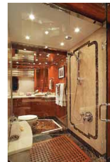
The headboard in the full-beam master is made of Capiz mother of pearl shells, cultivated in the Polynesian Islands. A marble shower separates his-and-hers areas in the master bath. The commercial-style galley, left, is the stuff chefs' dreams are made of.