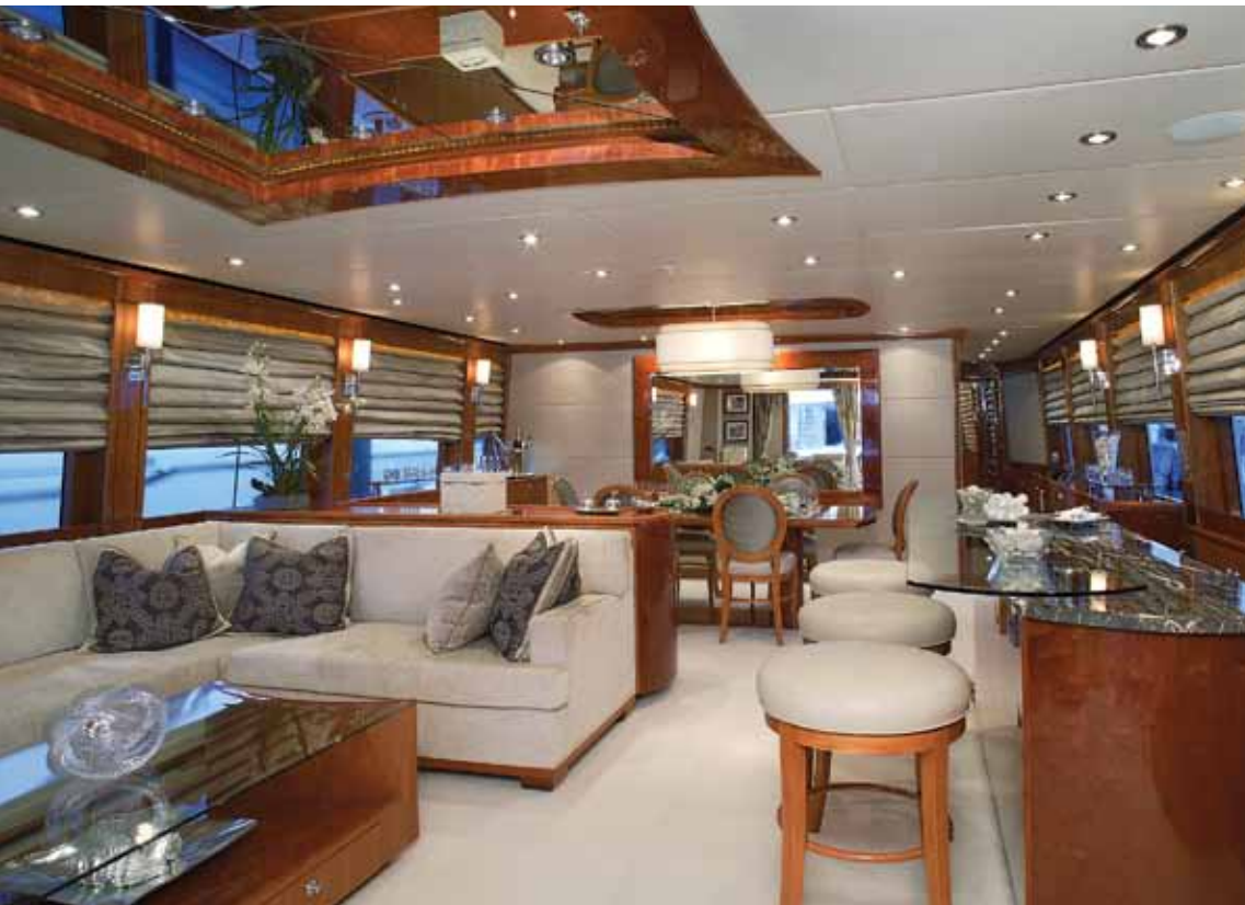
Previous spread: With strong, clean lines, Sassy is unmistakably a Hargrave. The redesigned flybridge is the perfect place for socializing. This page: Light fabrics, picture windows, and an open flow make the main salon, above left, an inviting space. Sassy is the first Hargrave to feature a main-deck cabin, upper right. The crew quarters boast a lounge and entertainment center, bottom right.